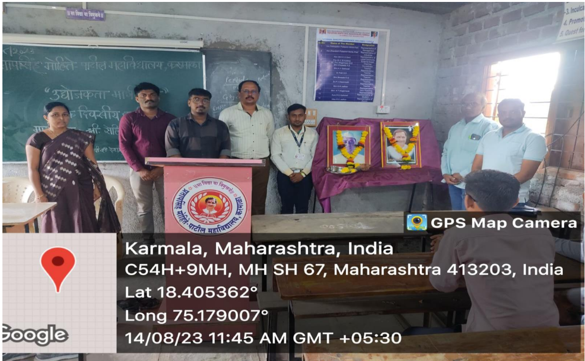
College staff and chief guest during image worship