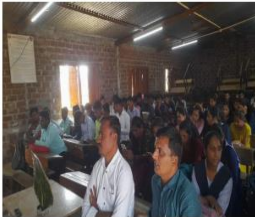
Glimpses of ABC ID Workshop