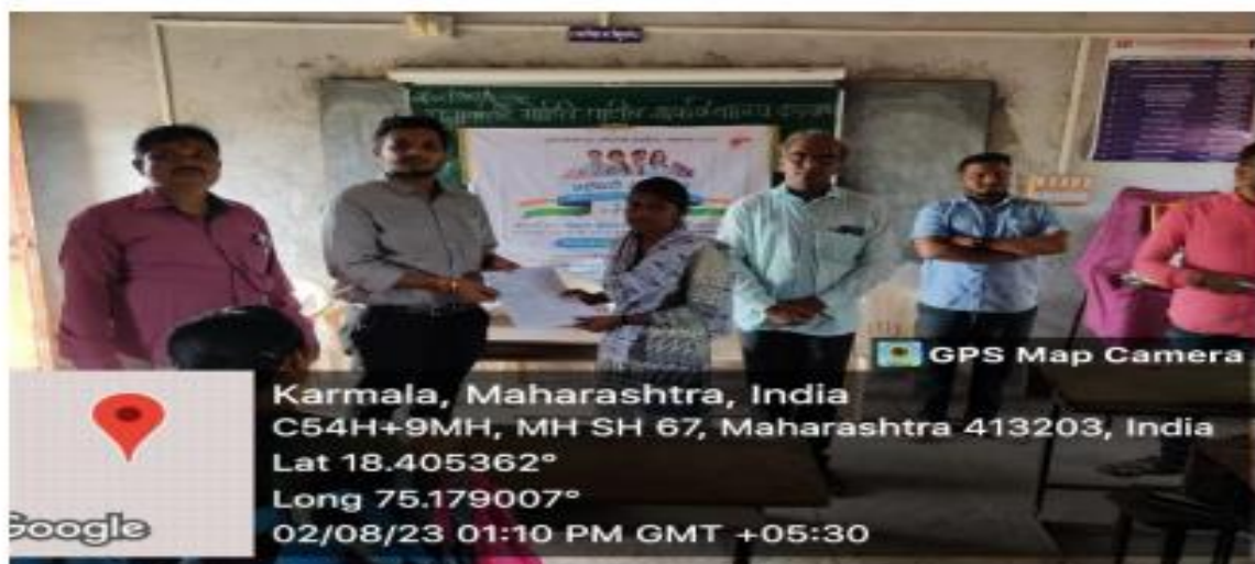
Voter Registration Form distributing to students